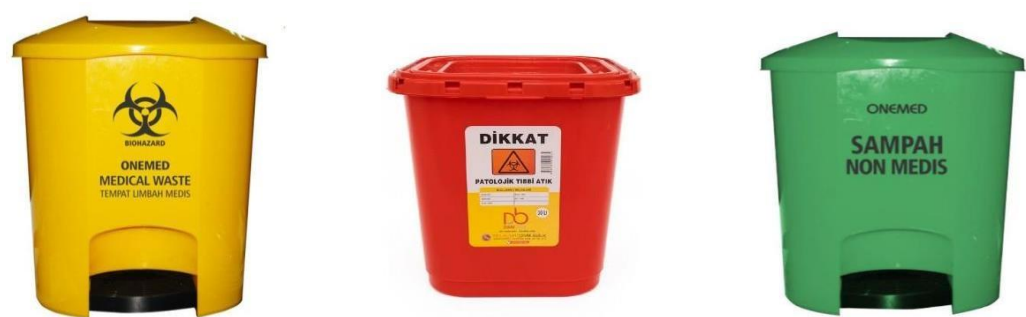
Figure 1.5 Trash Can

The benefits of placing a trash can in the interior of a hospital emergency department are to help visitors to health facilities reduce the feeling of discomfort when they are placed in a waiting position and also that paramedics feel comfortable in providing health services effectively and efficiently. According to Sanwal A, et al. (2015) hospitals must have good hygiene and keep their premises clean (interior). The atmosphere is generally healthy and periodic mopping works. The emergency room has a high standard of cleanliness and a sterilization system so that it does not pose a risk to the community (patients) (Capoor & Bhowmik, 2017). Therefore, hospital waste management (ER) is very important, so the placement of trash bins in the interior of the ER is based on the type of waste as shown in Figure 1.5 below: