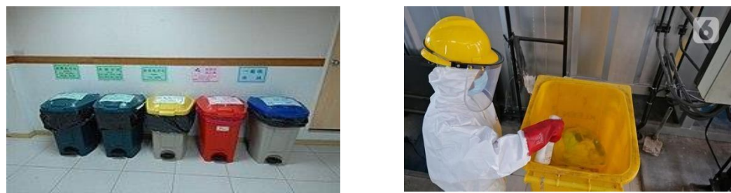
Figure 1.6 Storage and Transport

Storage and transportation of hospital waste, in general, must meet the following requirements: